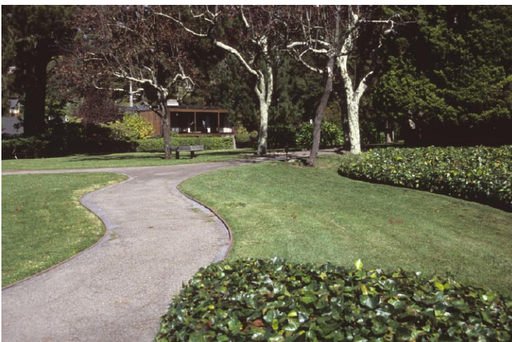
top image: Elevation of Blaisdell Residence, Henry Hill Collection, Environmental Design Archives, U. C. Berkeley. above: Greenwood Common looking east, photograph Marc Treib

To learn more, read the new publication, Living Modern: A Biography of Greenwood Common , by Waverly B. Lowell, available from William Stout Publishing, http://www.stoutbooks.com .